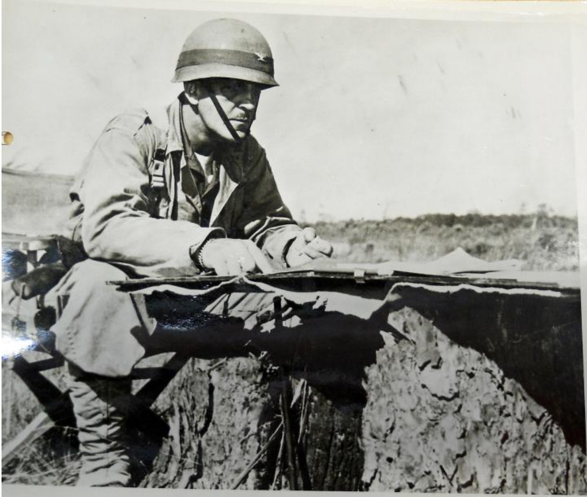
AT THE LOUISIANA MANUEVER AREA, 1943