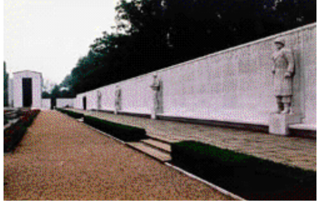
Wall of the Missing