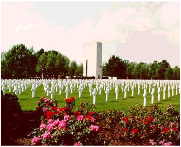
Graves and Memorial