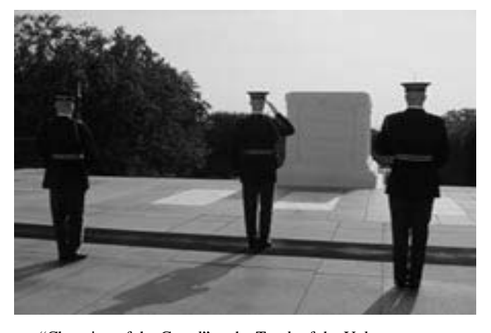
"Changing of the Guard" at the Tomb of the Unknown

There was quite a crowd of tourists still present after the changing of the guard when the officer in charge announced that men from the 103d Infantry Division would be placing a wreath at the tomb. After Instruction from the representative of the