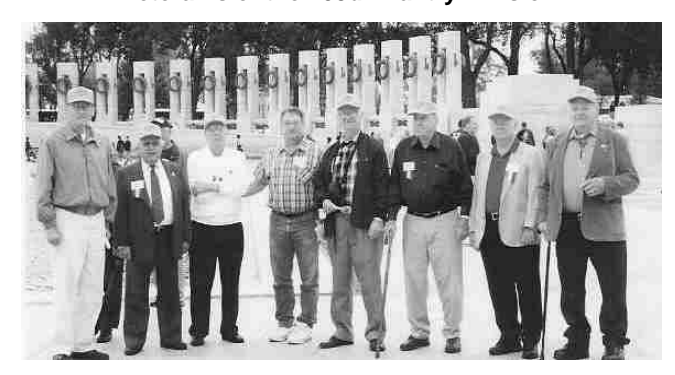
at the WW II Memorial.

The touring activity was a total success. One of our ladies declared the tours more like "Walking in the Rain" than anything else, but admitted that the rain contributed to a memorable experience.