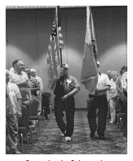
Presenting the Colors at the Annual Business Meeting

The touring activity was a total success. One of our ladies declared the tours more like "Walking in the Rain" than anything else, but admitted that the rain contributed to a memorable experience.