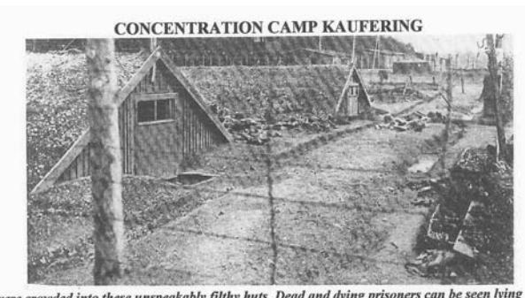
We were crowded into these unspeakably filthy huts. Dead and dying prisoners can be seen lying On the ground in this picture at the camp where I was incarcerated

I was born in Lithuania in 1927. In 1941, the Nazi Army seized Lithuania and immediately forced the entire Jewish population into Ghetto camps. The Nazi military rounded up Jews in the ghettos on a daily basis and shot them by the hundreds. Out of a population of 30,000, they decimated it to 2,500. They burned down the hospital with patients still alive in it, and took every child under the age of 14 away from their parents and murdered them. Somehow, my father, I, and one of my older brothers survived this onslaught. I saw another brother beaten to death by a Nazi guard.