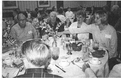
When with good friends you can be yourself. That's where the fun has to be.