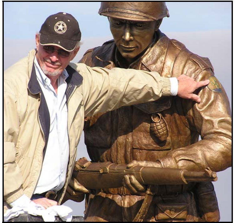
Talk about detail, Look at that Colored Arm Patch