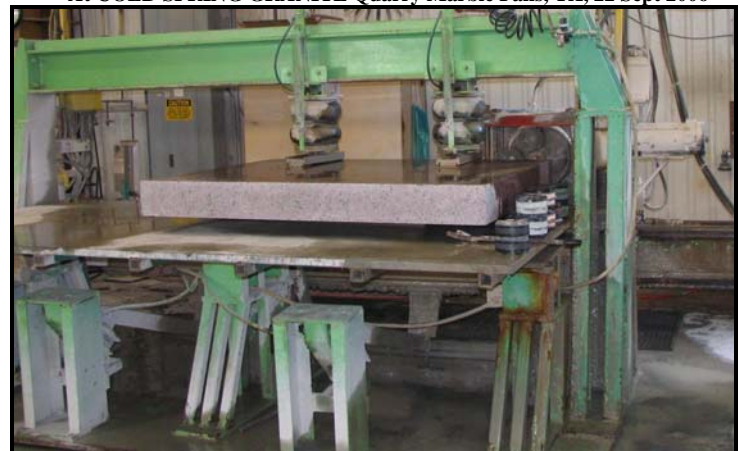
Polishing one of the five slabs for the BATTLE DEATHS At COLD SPRING GRANITE Quarry Marble Falls, TX, 22 Sept 2006