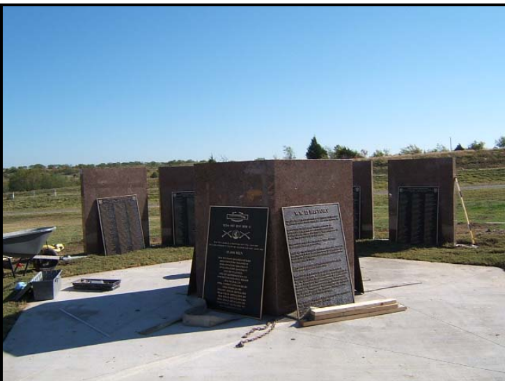
Bronze Plaques in place 26 October 2006