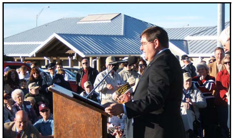
US Representative The Honorable Michael Burgess