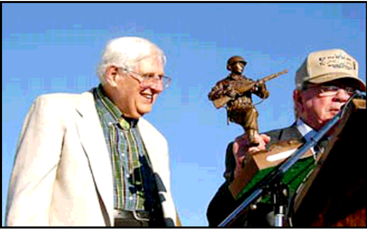
Rabbit awards Mel Serial No 1 Maquette