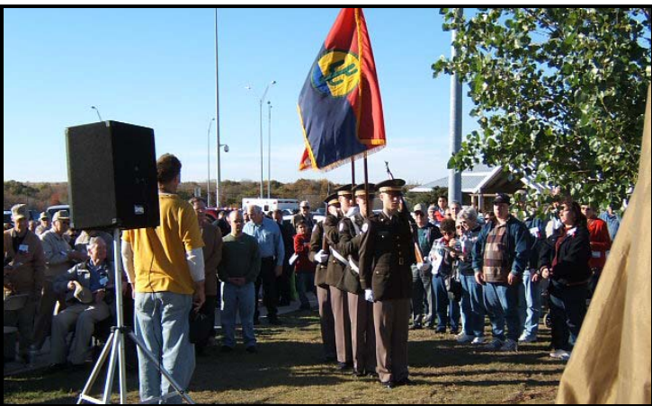
Posting of Colors by Texas A & M Cadets