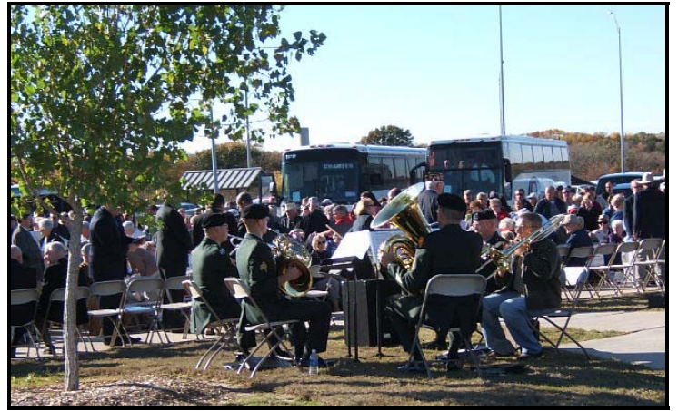
Band from Fort Sill Oklahoma Army Base