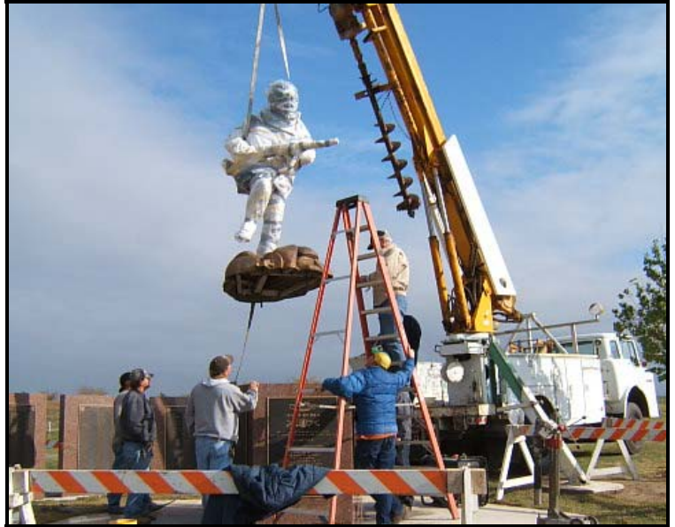
Installation of Sculpture A CALL TO DUTY 4 Nov 2006