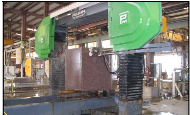
Cutting 10 ton Square Sunset Red Granite block into Pentagon Base At COLD SPRING GRANITE Quarry Marble Falls, TX, 22 Sept 2006