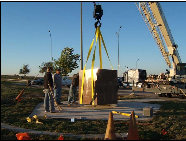
Lowering granite base for statue 21 October 2006