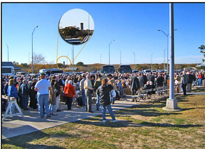
Silo on horizon is Camp Howze Water Tower