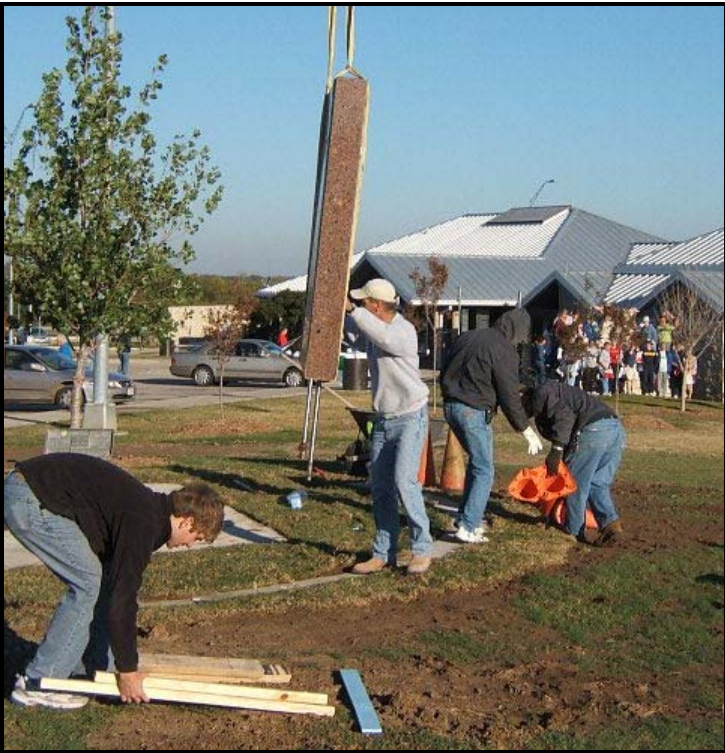
Lowering granite Battle Death Slab 21 October 2006