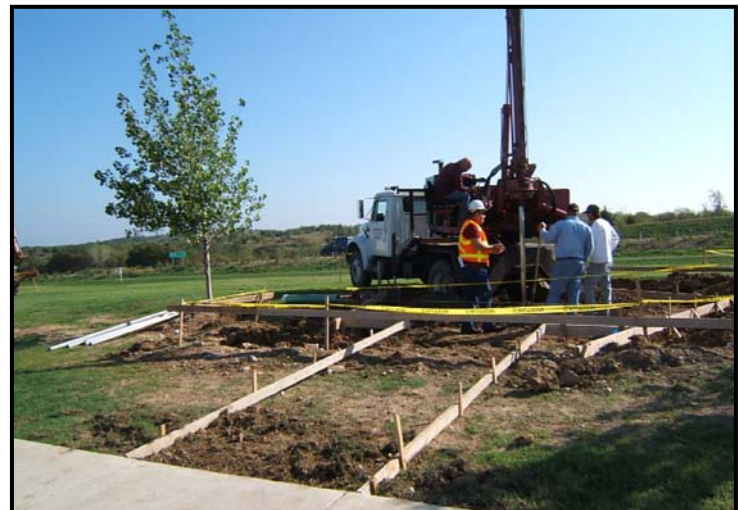
Drilling 18 inch Hole 18 ft deep for Base and A CALL TO DUTY Support