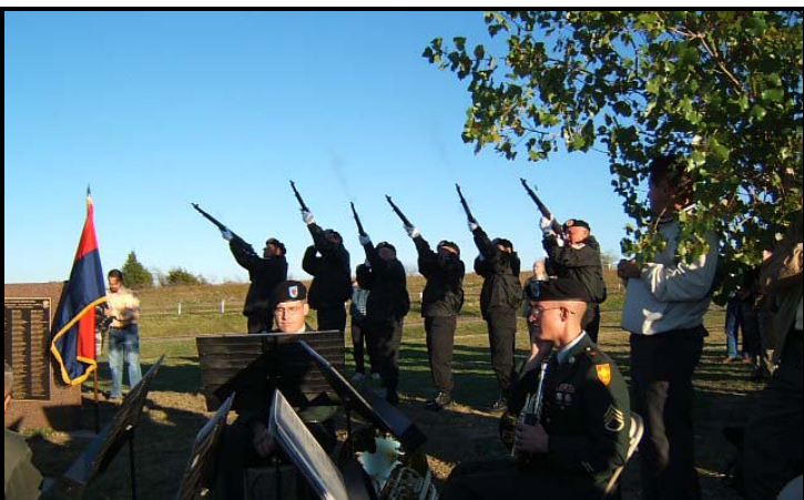
Rifle Salute by Gainesville VFW Post 1922