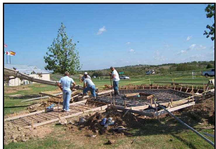
Pouring concrete for Monument