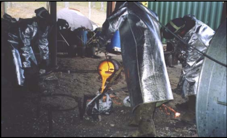
Pouring statue bronze Combat Boot at Foundry, Bastrop, TX, 21 Sept 2006