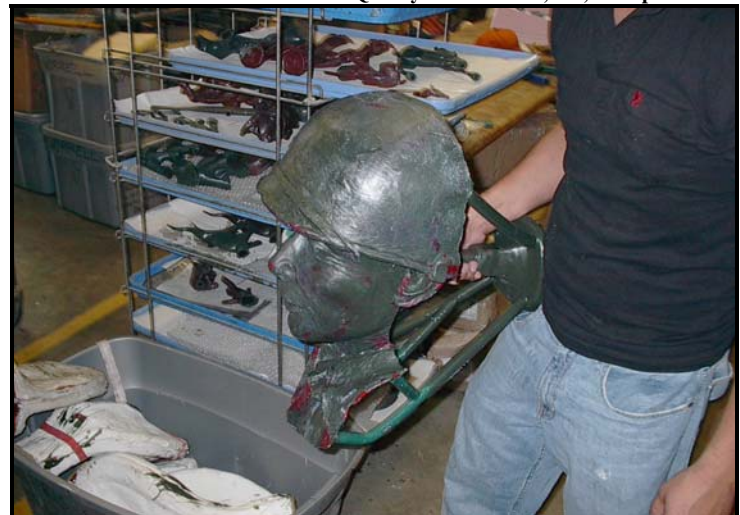
Head Casting at DEEP IN THE HEART ART FOUNDRY Bastrop, TX 21 Sept 2006